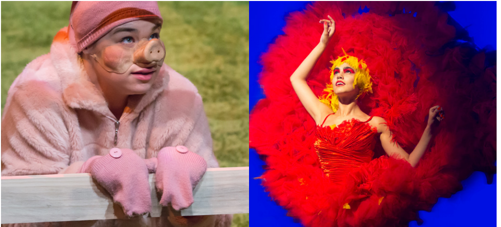
Above: A selection of Stage School Australia productions

Stage School Australia runs several highly successful programmes for young people including Young Australian Broadway Chorus, Victorian Youth Theatre, Beginners OnStage and the Australian Boys Dance Academy. Stage School Australia also provides industry representation through its agency, the Talent Company Australia.