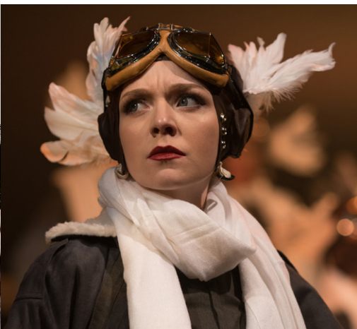
Above: A selection of Stage School Australia productions

Our recent successful seasons have included CATS , Wicked , Les Misérables and Spring Awakening at The National Theatre Melbourne, Conference of the Birds , Seussical , and Joseph and the Amazing Technicolor Dreamcoat at the Malthouse Theatre and Adelaide Fringe Festival, Honk! and Chicken Licken at the Southbank Theatre and Adelaide Fringe Festival, as well as a series of junior musicals which included Guys and Dolls , The Wizard of Oz , Aladdin , The Little Mermaid , Shrek , Madagascar at the Union Theatre, Alice in Wonderland JR and The Secret Garden at Southbank Theatre, and Give My Regards to Broadway at Hamer Hall.